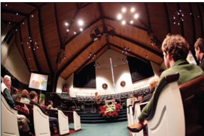
Youth Worship Arts presents "The Incredible Journey"